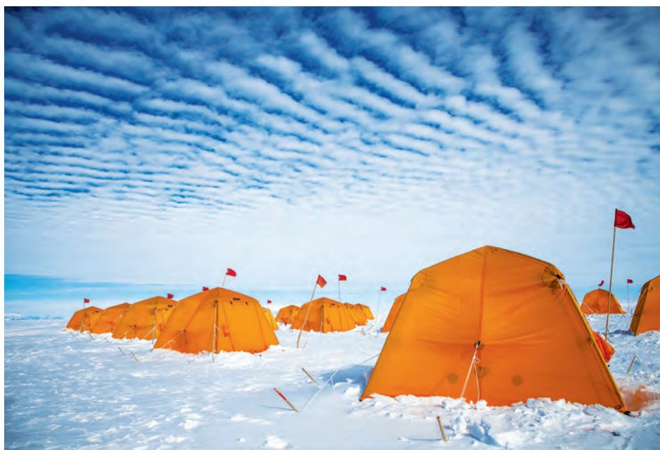
COLD START: Researchers camping on the Ross Ice Shelf in January drilled through 740 meters of ice to see what existed at the grounding zone far below.